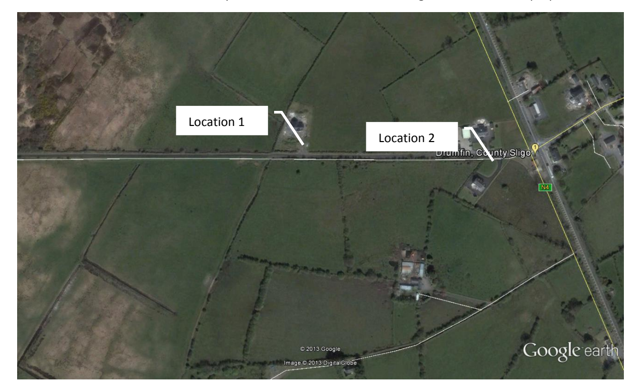
Figure 1-1: Noise survey locations